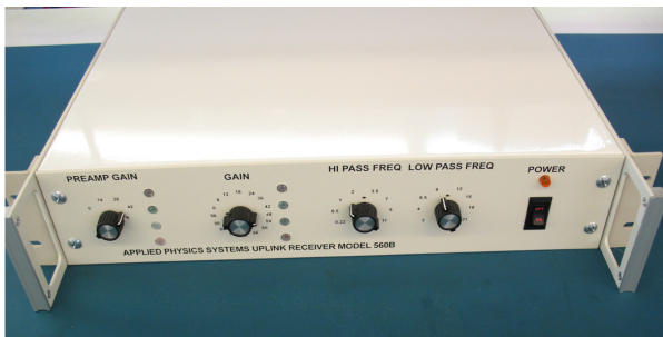
Uplink Receiver — 560 Unit

The Uplink Receiver (560 Unit) boosts and filters the analog signals from the antennas. The Downlink Transmitter (574 Unit) provides the high power required for downlinking to the downhole system.