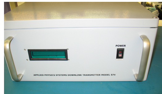
Downlink Transmitter — 574 Unit